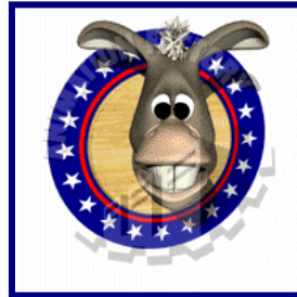
The Democratic Club of the Santa Clarita Valley