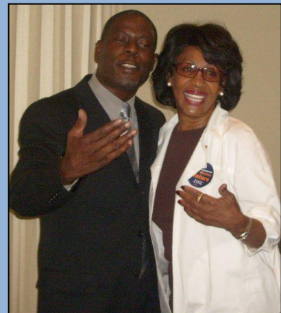
Parker w/Hon. Maxine Waters