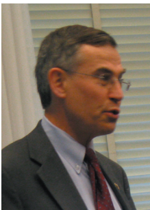
Rep. Rush Holt

The Society for Neuroscience has called Research!America "the leading coalition aiming to make medical research a higher national priority."