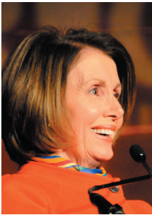
Speaker Nancy Pelosi

"Doubling the NIH budget was not possible without Research!America . Our inside maneuvering relied on your outside mobilization." —Speaker Nancy Pelosi (CA)