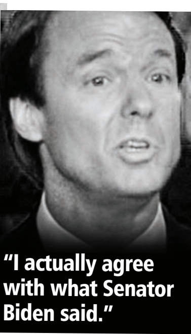
Democratic Candidates Debate – ABC News

"I actually agree with what Senator Biden said."